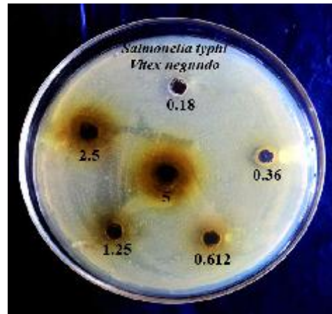
Figure 2. Zone of inhibition of Vitex negundo against Salmonella typhi